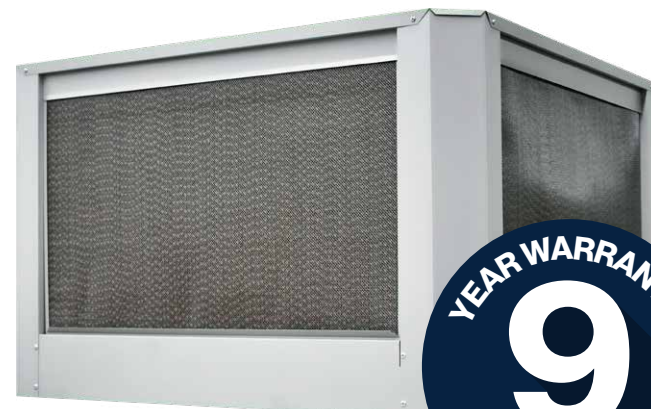
Brivis AD BAL