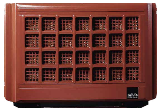
Brivis AD Cooler