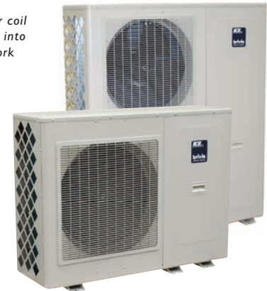
Brivis ICE Add-on refrigerated cooling system outdoor units