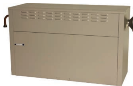
Brivis MX - Outdoor Unit