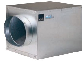
The Brivis ICE Add-on refrigerated cooling system series indoor coil unit is incorporated into your heating ductwork

Brivis ICE Add-on refrigerated cooling system comes with a full five year warranty on parts and labour.