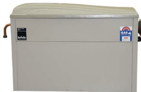
Brivis HX - Outdoor Unit