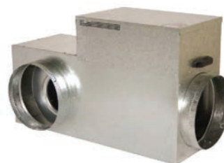
Brivis HX and MX - Indoor Unit

High efficiency is only part of the story, the Brivis StarPro MAX range also provides the highest levels of quality and flexibility and the best value for money.