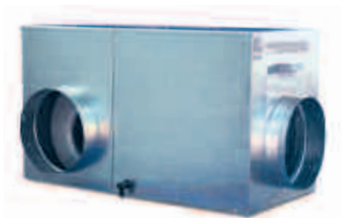
The internal MPS can be divided into two pieces for easy installation.

The MPS units are designed to fit easily into any roof, under the floor or unobtrusively beside the house.