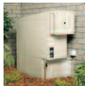
The external Buffalo.

The Classic series comes with a choice of three controllers - the Networker*, Manual or Programmable Controller. Some models also come with the option of extra air (XA) and LPG.