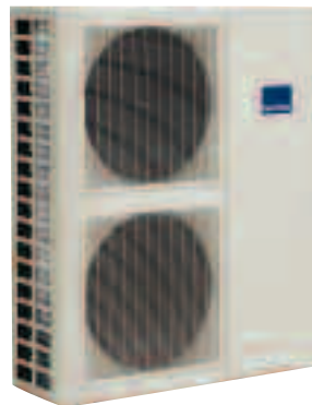
The ICE series outdoor unit.