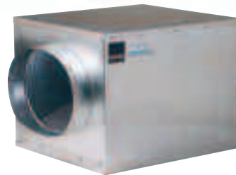
The ICE series indoor coil unit is incorporated to your heating ductwork.