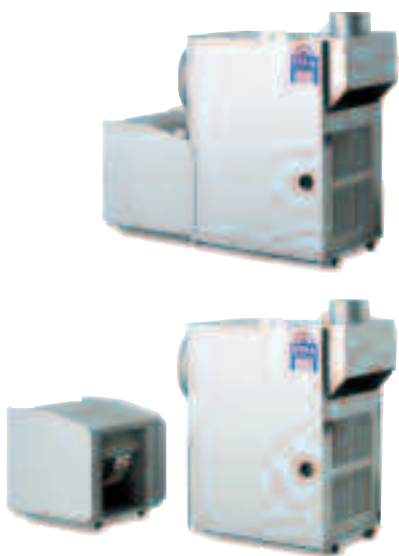
The Two Piece Wombat for easier installation.

The Classic series includes heaters for all types of homes. The Two Piece Wombat range of heaters have a 3 star energy rating, which means lower running costs for you. And plenty of air for Brivis ICE add-on cooling.